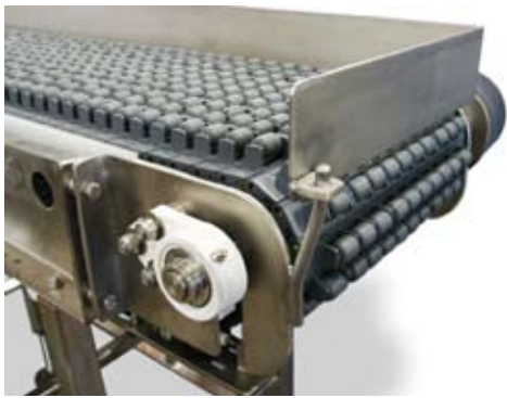
Product holding conveyors keep your product stationary