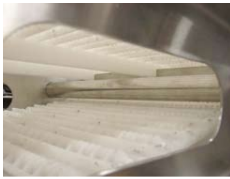
Easy wash-down access to all areas of the conveyor