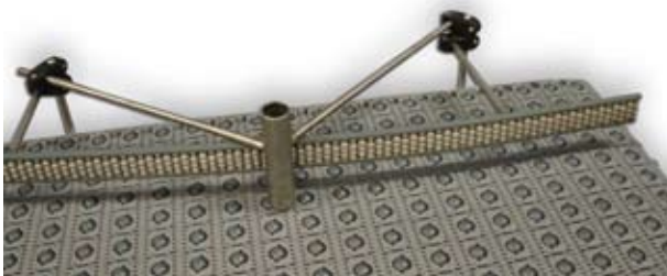
Box turning conveyors to rotate your products in motion