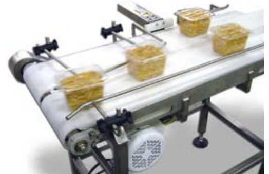
Line convergers combine multiple lines to single lines