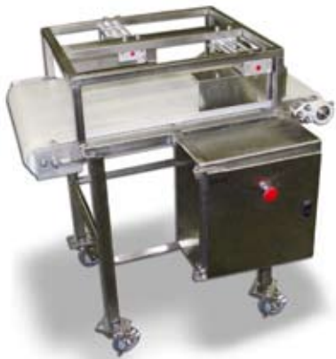
3 to 1 lane, line converger