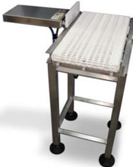
Divert conveyors can be added to remove out-of-tolerance products