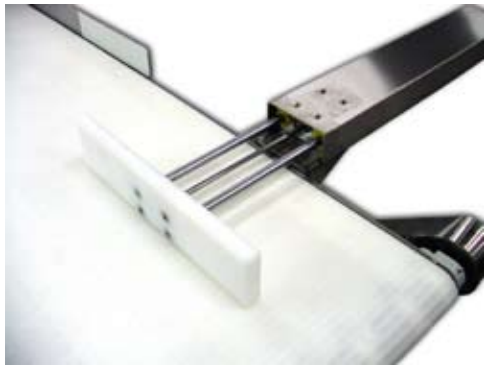
Optional divert to remove out-of-tolerance products