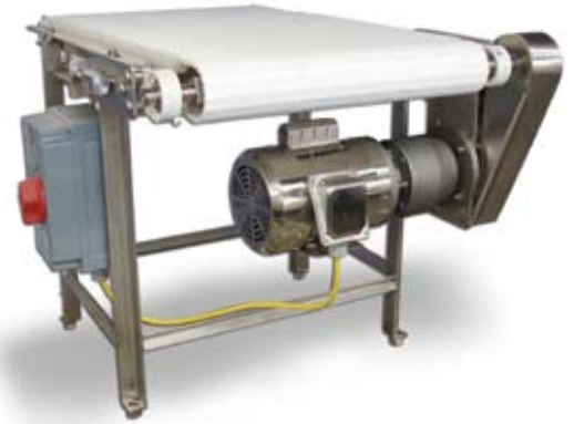
Stand alone conveyors of various sizes, heights, and lengths