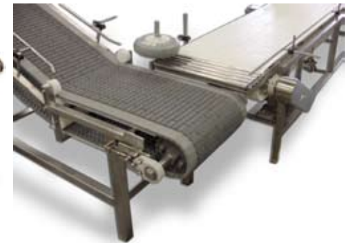
Inclined converging conveyor with box turner & non-slip treading