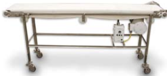
Stand alone conveyor with angle-iron legs for wash-down compatibility