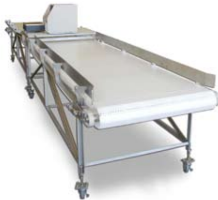
Configure a conveyor today!