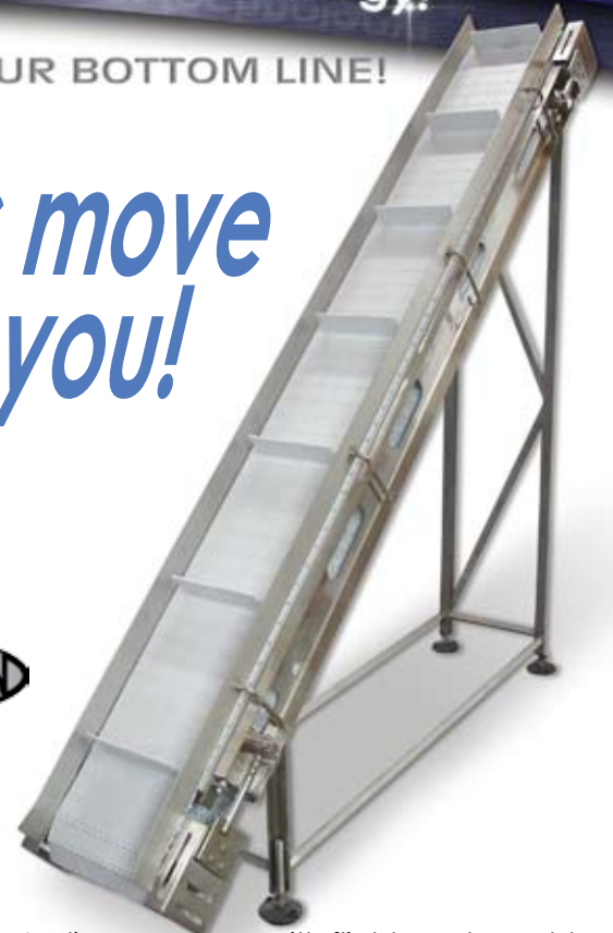
Incline conveyor with flights & cleanable product guides