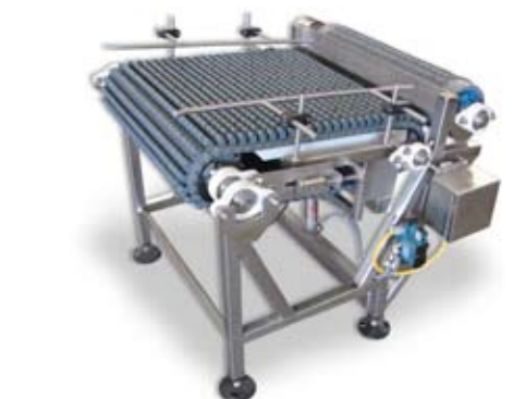
Indexing conveyors allow boxes to be appropriately spaced for further applications