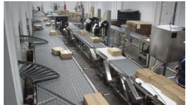
Conveying product in a labeling and palletizing room