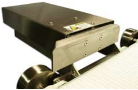
Choice of diverting technologies