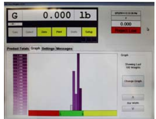
Large, intuitive 17" touchscreen display

Call for a custom quote based on your product specifications, production rate, and environment. See why we say, "Get way more for way less with a WeighMore® In-motion checkweigher!"