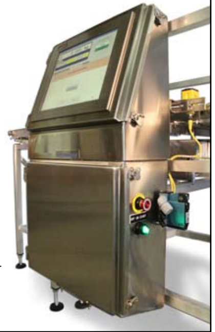
Open, cleanable design