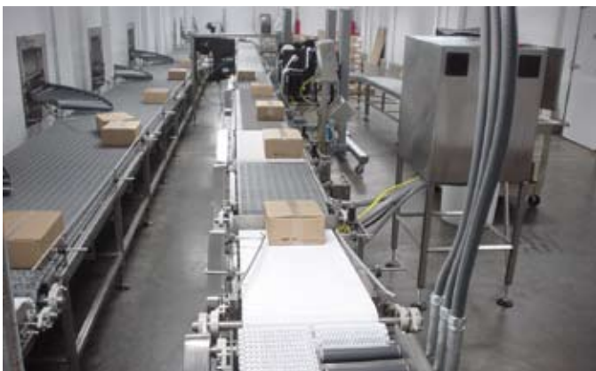
Our indexers assure equal product spacing