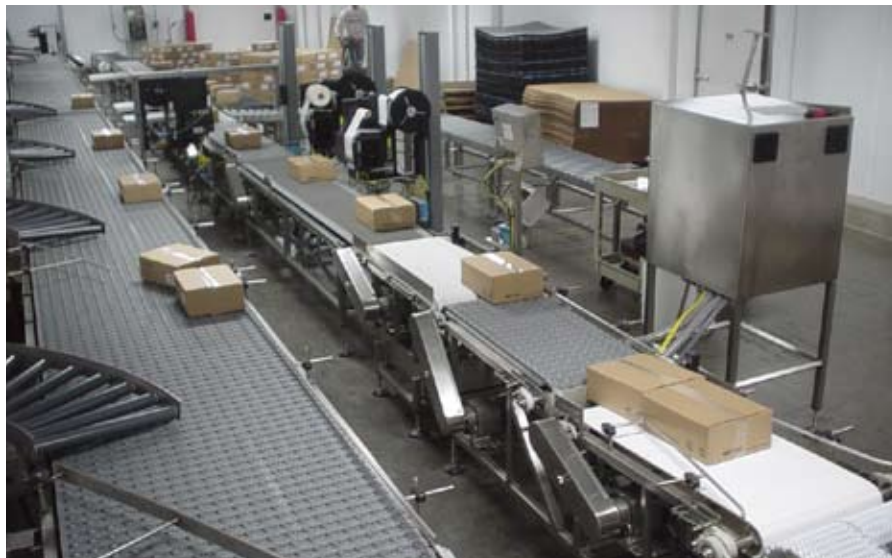
Conveyors, Scales, Indexers, and Labeling machines to mark each item correctly and accurately measure the product

The Vande Berg Scales Automated Box Labeling System eliminates many of the labor-intensive tasks associated with box labeling. The system uses a barcode scanner to recognize the product ID as it moves along a conveyor. As the product moves across the in-motion conveyor scale, the weight is recognized by the controller equipment. The Vande Berg Scales system automatically determines the tare weight for the product as well as the acceptable weight parameters. The system labels the box with the net weight label, accumulates the daily production totals, and adds the box information to the appropriate product pallet manifest.