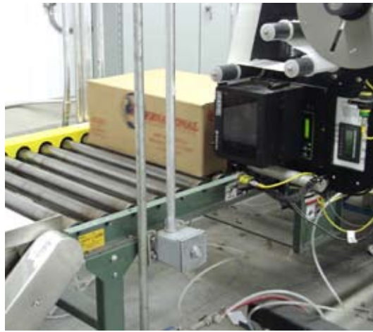
Machine applying labels