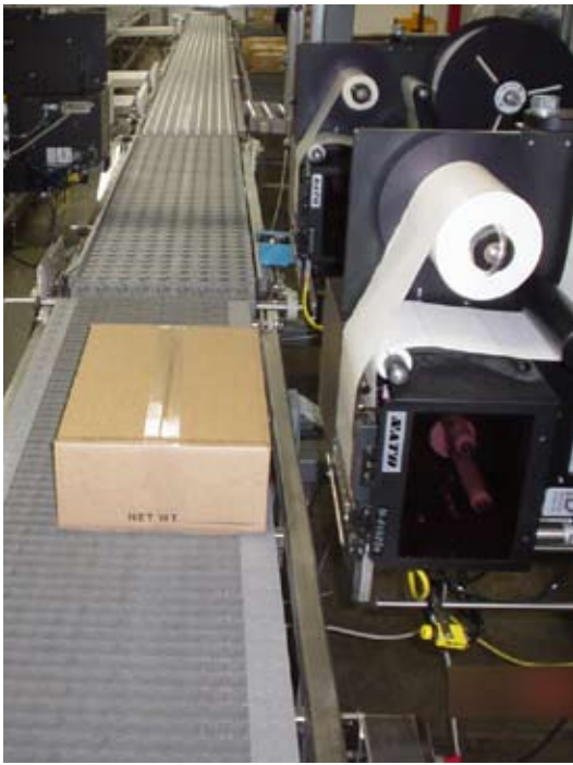
Print & Apply Labels