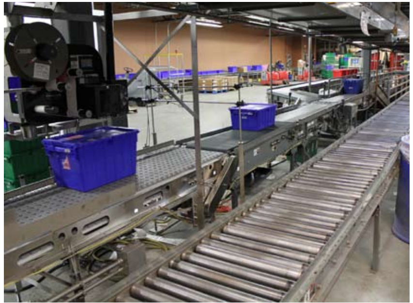
Automatic tote labeling system