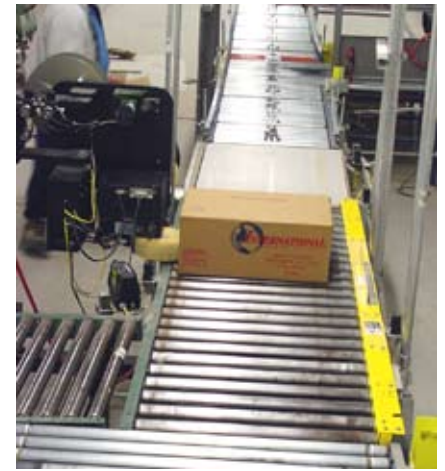
Auto-box labeling machine