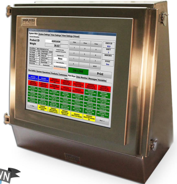
SDS HMI with standard box labeling program

One platform...nearly limitless applications