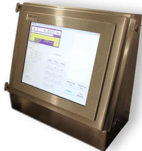
The NTEP approved weight indicator option combines two hardware components to conserve space and simplify usage.