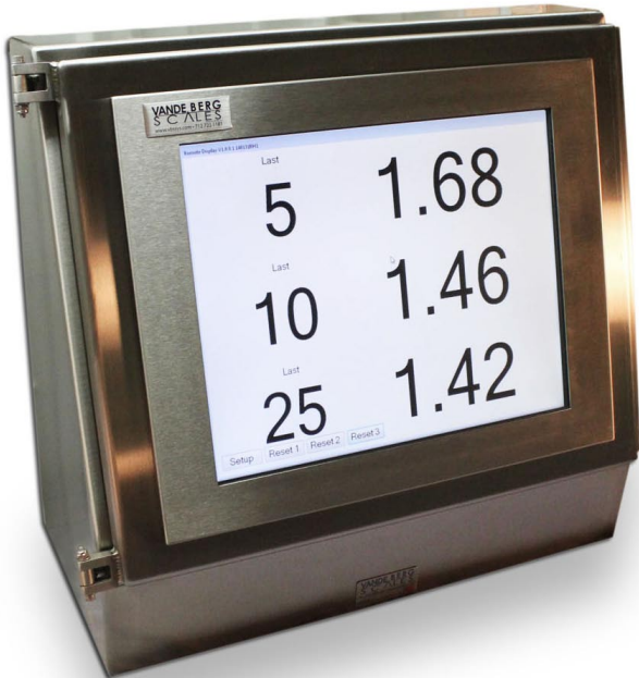
Our 17" touchscreen controller provides operator efficiency, clear, intuitive inputs and easy menu navigation

Our SDS HMIs are the cornerstone of the equipment we manufacture, used to control our systems