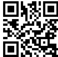
Scan this 2D barcode to see our video on our Washdown Industrial Controllers

High temps? No problem. Our HMI can function in 105° F ambient temperatures.