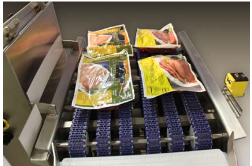
Two rows of product are indexed on multiple blue belt segments to combine into one line of product.

Multi-lane singulators are designed to save you money by eliminating the need to manually singulate and space package products.