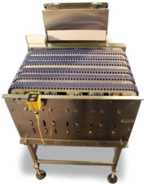
Multiple belt lanes permit one machine to accommodate varying product width. This unit can singulate product width spanning 2 or 3 belts.

Multi-lane singulators are designed to save you money by eliminating the need to manually singulate and space package products.