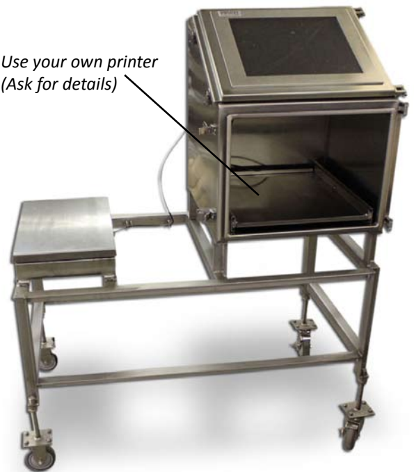
Mobile manual weigh price labeling system with human machine interface with a NEMA-4x enclosure.