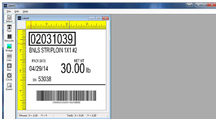
Included software permits complete customization of label layout with purchased printer. Software can be installed on a host and pushed out to each unit, if desired.