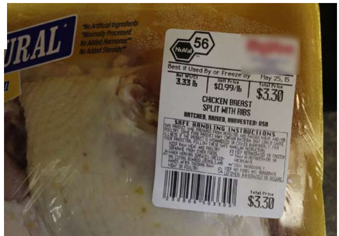
Whole chicken breasts labeled with a manual weigh price labeler.