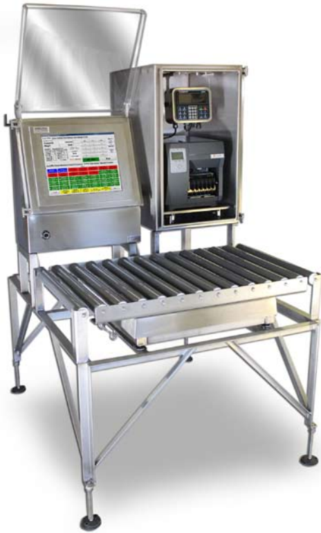
Manual box labeler with roller top scale

The next generation of weigh price labeling