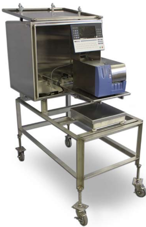
Washdown manual box labeler with scale in front of printer