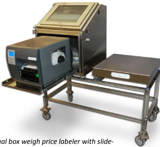
Portable manual box weigh price labeler with slide-out printer drawer, touchscreen HMI interface and scale in NEMA-4X construction