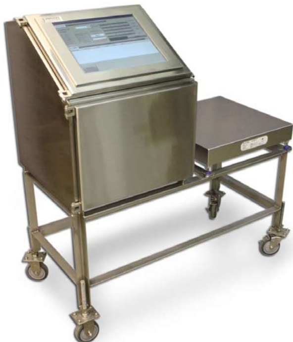
Mobile manual weigh price labeling system with human machine interface with a NEMA-4x enclosure. (Showing door closed for washdown)