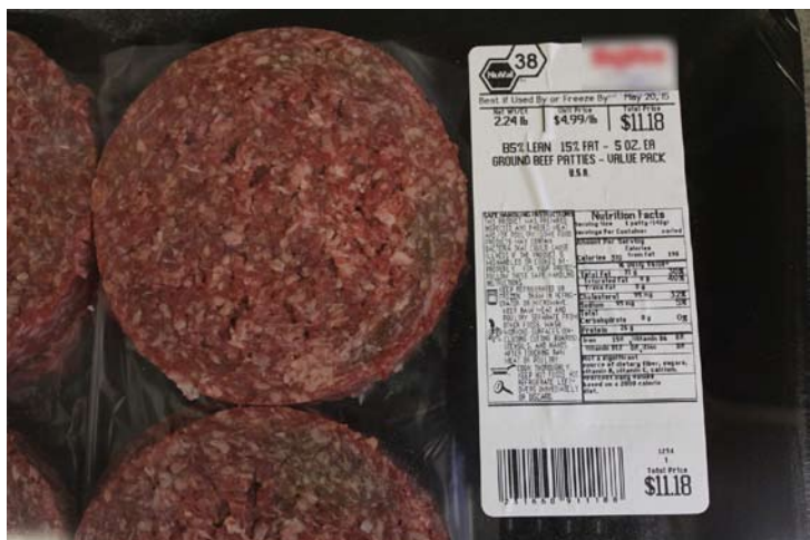
Hamburger patties labeled with a barcode weigh price labeler