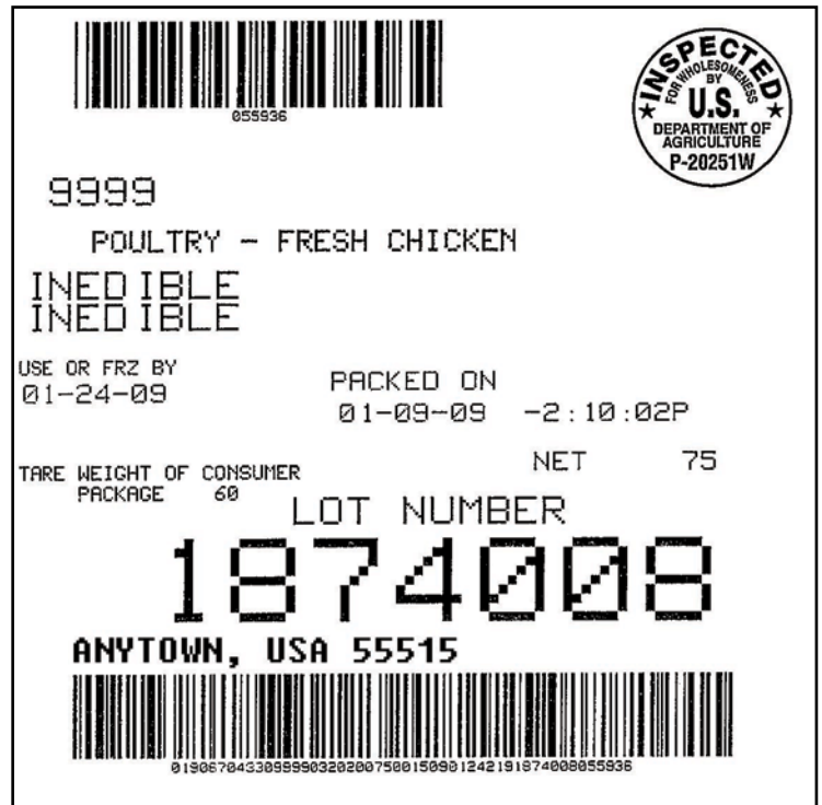
Representation of an actual label.

Once a steady weight is obtained, the system can automatically generate a box label that the operator then manually applies to the box.