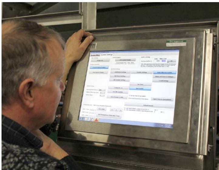
Actual program using an anti-obsolescent touchscreen.