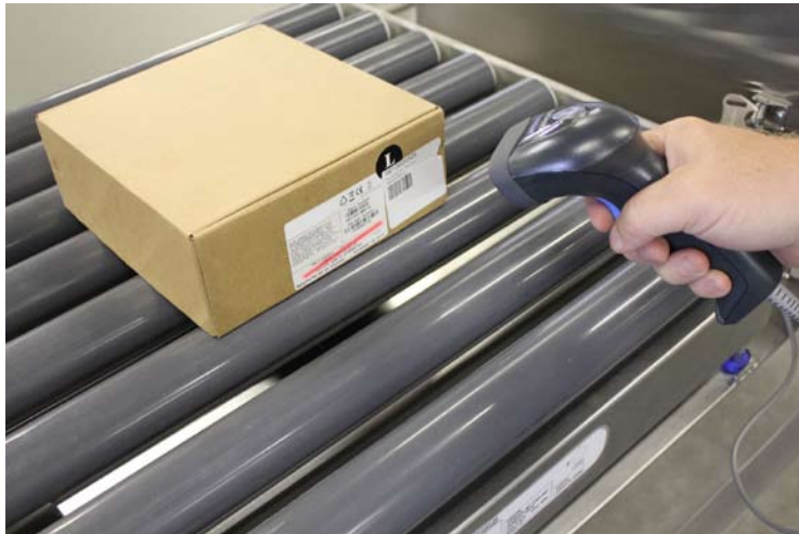
Barcode scanner is useful for scanning a pre-ident and creating a secondary label